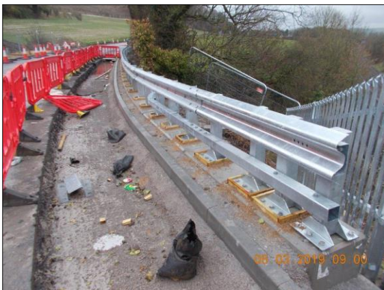
Preventing vehicle incursions onto the railway is important for safety reasons. Major work was carried out on the B3414 at Norton Bavant

In 2018/19 Wiltshire Council in partnership with Atkins and Ringway have reconstructed or strengthened a number of bridges, including Lenton Bridge at Atworth, Rowden Bridge at Chippenham, redecking and widening at Woodbridge, Westerly and Easterly Bridges at Brokenborough, waterproofing at Gall Bridge Barford St Martin and reconstruction of a retaining wall at Great Wishford. Ringway also carried out a major scheme to prevent vehicle incursions onto the railway at Norton Bavant.