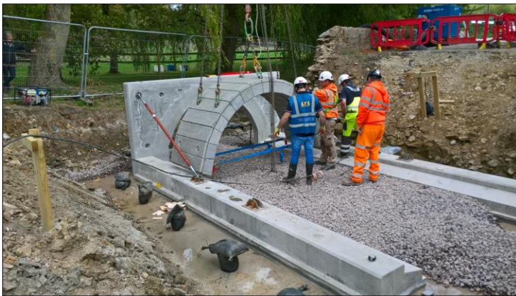
A programme of bridge strengthening and renewal was undertaken by the Council's contractors

Ringway operate three full time bridge construction/maintenance gangs to carry out works from minor maintenance up to full bridge reconstruction. Additional resources and sub-contractors are on occasions called upon to cater for extra large schemes or more specialist schemes.