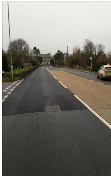
The programme of road resurfacing is improving the strength and surfaces of the county's road network.

The programme of planned maintenance has seen a substantial improvement in the condition of the county's roads in the past decade, but there is still a backlog and continued investment is required.