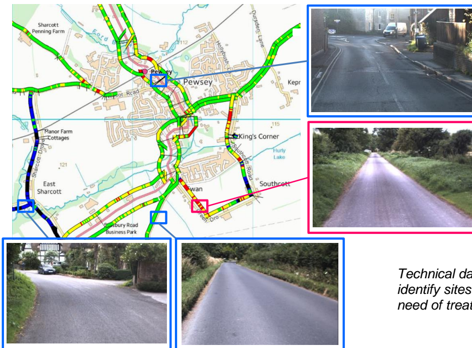
Technical data is used to identify sites potentially in need of treatment.

Technical data, including surveys by vehicle mounted lasers, is used to assess road conditions to prioritise sites for treatment. Road safety is the priority, and maintaining adequate skid resistance on the busy high speed roads is vital.