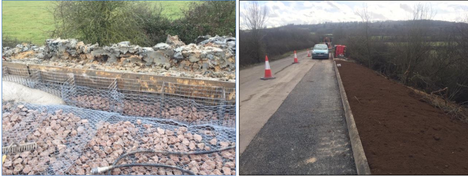
Major repairs using gabion baskets were undertaken to address serious verge and carriageway edge failure

At Grittenham the verge and carriageway edge was beginning to suffer serious structural failure and was causing safety concerns.