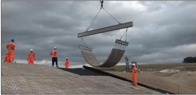
A substantial flood alleviation scheme was constructed at Tilshead to reduce the risk of flooding

A major flood alleviation scheme was carried out at Tilshead in conjunction with the Environment Agency on Ministry Defence land. The scheme created a reservoir to store flood water during potential flood conditions. It was designed by Atkins and constructed by Ringway and their specialist sub-contractor M.J. Church. The scheme involved earthworks to create a retaining structure with a controlled outlet. The scheme reduces the flood risk in Tilshead, Orcheston and on the A360.