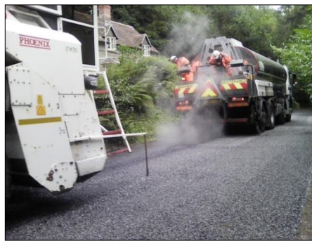
An extensive programme of surface dressing helps seal and protects the county's rural roads, and improves skid resistance.

A programme of surfacing work was undertaken by the Council's contractor Tarmac to strengthen and resurface roads across the county.