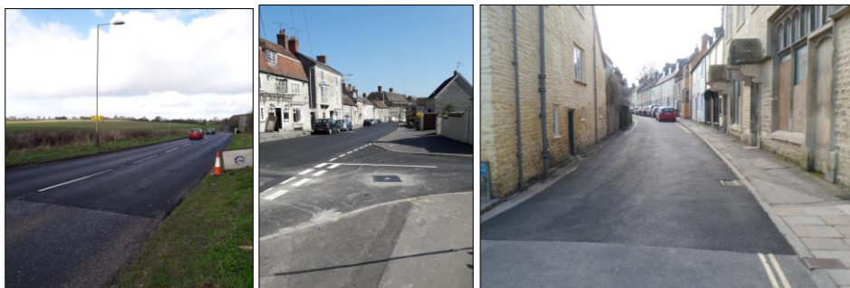
Wiltshire Council is making a major investment in improving the condition of the county's roads.

Preventative asset management practices continued to be applied in 2018/19, using carriageway condition survey data to identify potential schemes, leading to more effective management of the network.