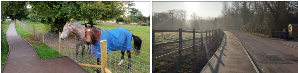
New footways and pedestrian facilities have improved routes to schools and pedestrian routes.

Development work was progressed on a number of Taking Action on School Journeys schemes, 20 mph speed limits and safety schemes for delivery next year. The close working relationship that the team has with the CATGs continued and helps to identify and deliver local priorities.