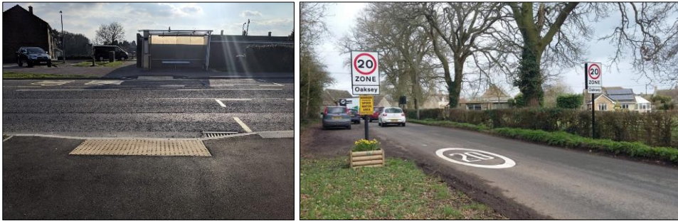
A number of pedestrian improvements and traffic management schemes have been constructed

The team has also delivered a significant number of smaller scale projects, such as pedestrian crossings, area wide 20mph speed limits, advisory 20mph speed limits outside schools, footway improvements and gateway schemes.